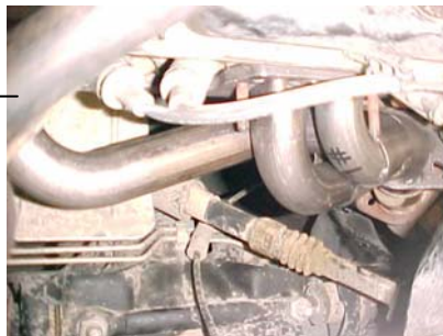
Drivers Side Gibson Header