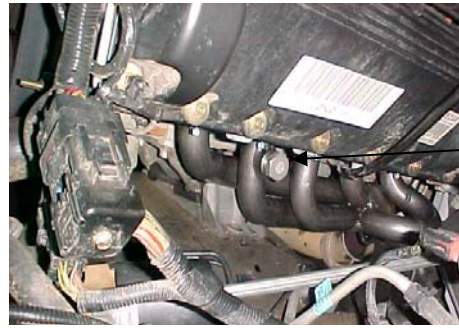
EGR PLUG IN HEADER