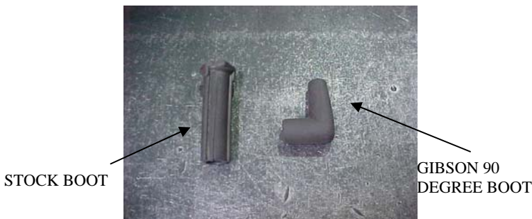
WHEN INSTALLING HEADER, SPARK PLUG WIRES #1 & 6 NEED TO BE SWITCHED FROM THE STOCK BOOT TO THE 90 DEGREE BOOT THAT IS SUPPLIED BY GIBSON