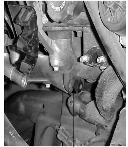
EGR TUBE FITTING

8) REMOVE THE SIX BOLTS ATTACHING THE MANIFOLD TO THE HEAD. REMOVE THE MANIFOLD. CLEAN THE SURFACE OF THE HEAD. REMOVE ANY CARBON DEPOSITS THAT MAY BE ON THE HEAD. PREPARE THE SUPPLIED HEADER BOLTS WITH ANTI-SEIZE TO THE THREADS.